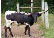
TH DOLLA DOLLA