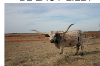
BL LACY LILLY