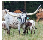
BL LACY ROSE