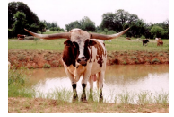
Field Of Pearls