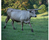
TH MINNIE PEARL